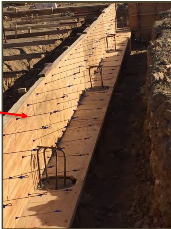
Forms in Area D