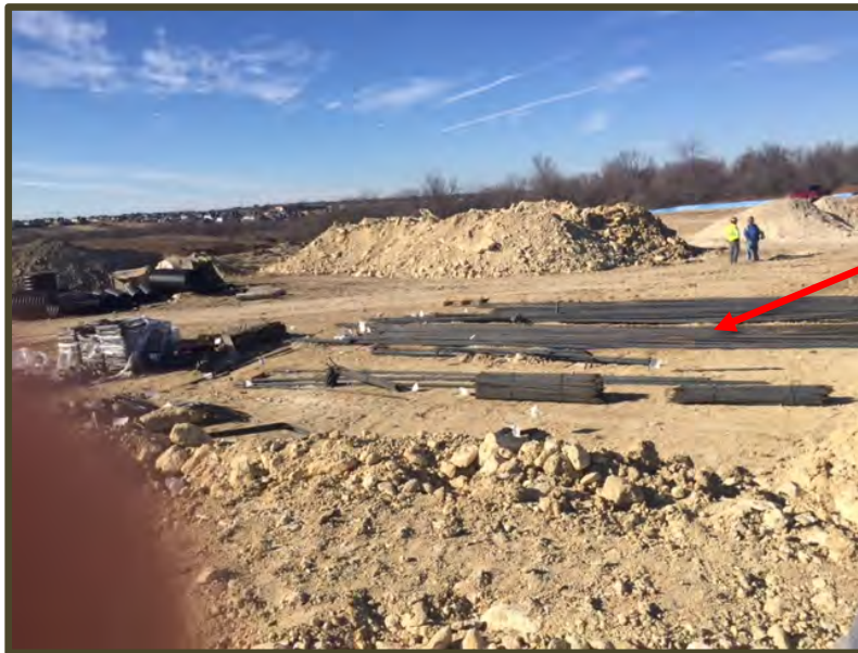
Grade Beam Steel